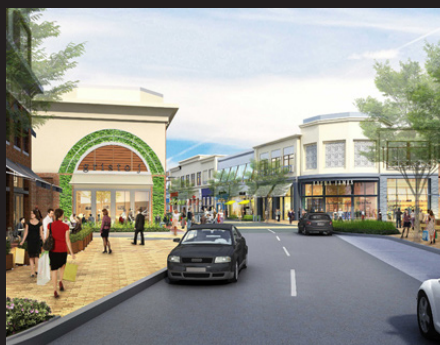
Macerich's New Broadway Plaza at Walnut Creek San Francisco