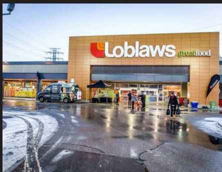
Neighbourhood centres Toronto