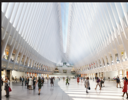
Westfield's new World Trade Center New York

This year, after many years of little development activity in the regional mall space, we'll see and learn about a number of major development projects, both recently completed and under construction. These include: