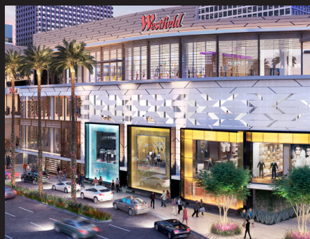
Westfield's Century City development Los Angeles