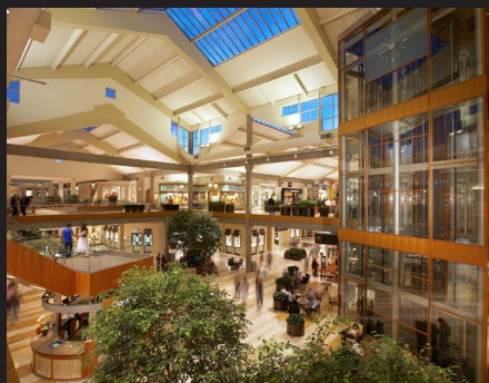
The Bellevue collection & mixed use development Seattle