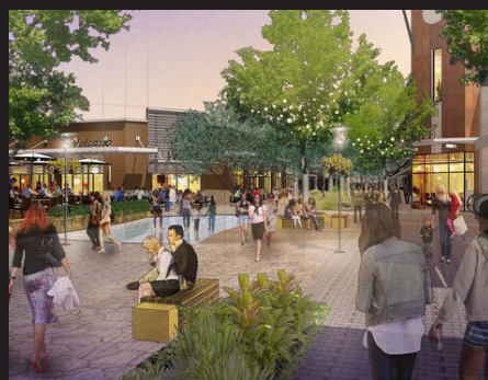
Westfield's new 'Village at Topanga' Los Angeles